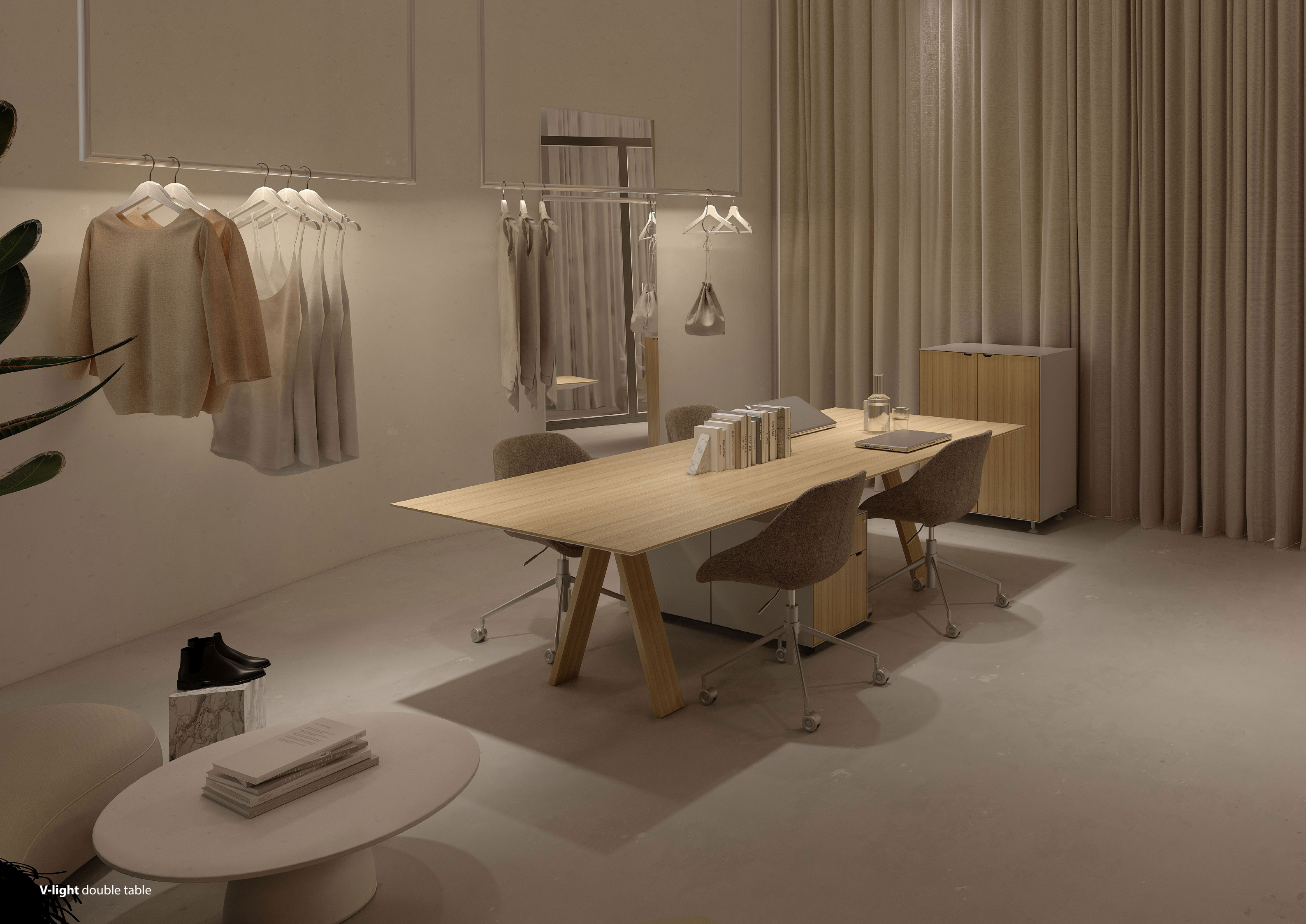
V-light double table