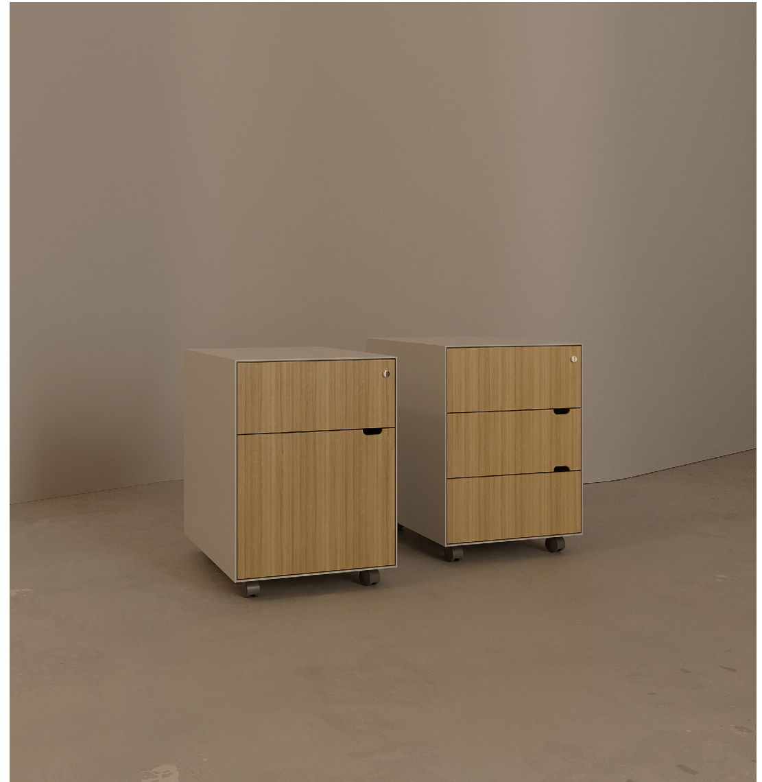
V-light mobile pedestal