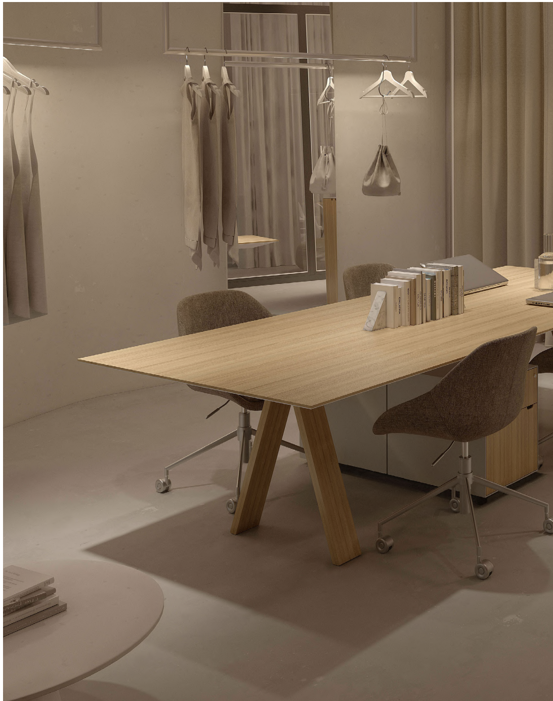
V-light double table