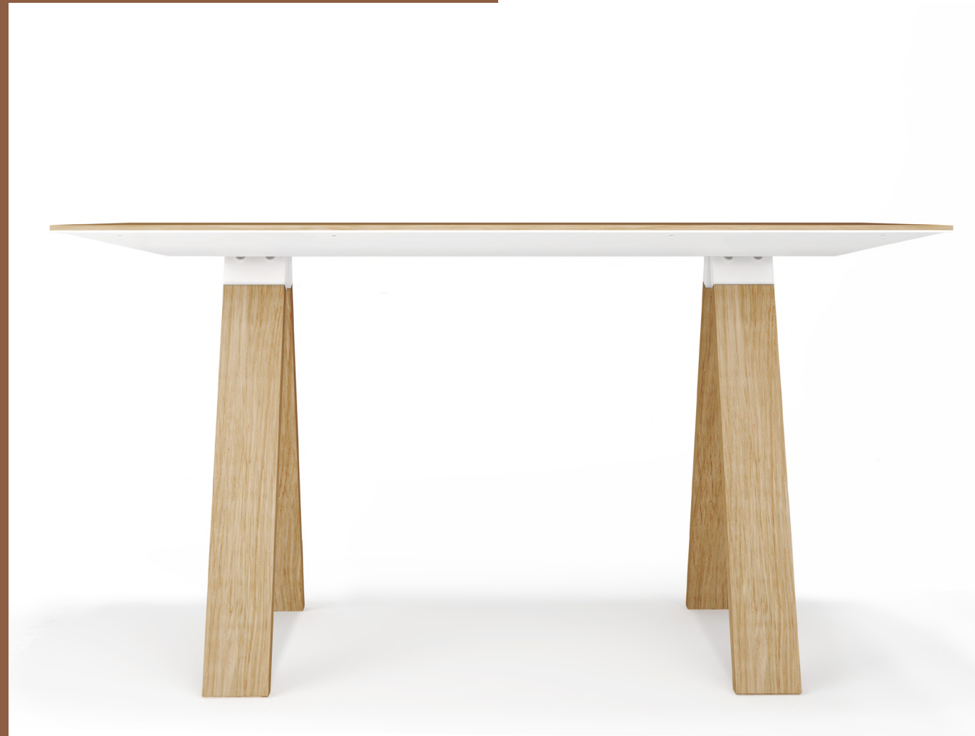
V-light _Individual Desk